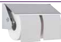
WP 149 page 57