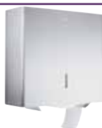
WP 163 page 58