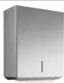
PP 113 page 100