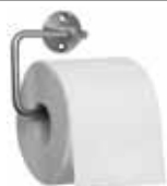
AC 250 page 55