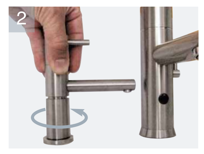
Twist top of dispenser 45° anti-clockwise