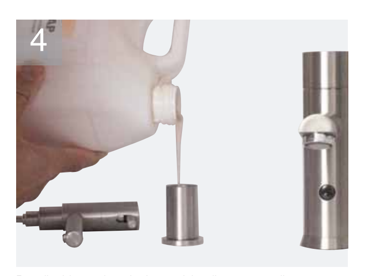
Pour liquid soap into the base of the dispenser, until undercounter bottle is full