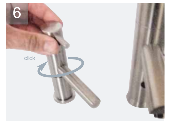
Turn top of dispenser clockwise until you feel a 'click'