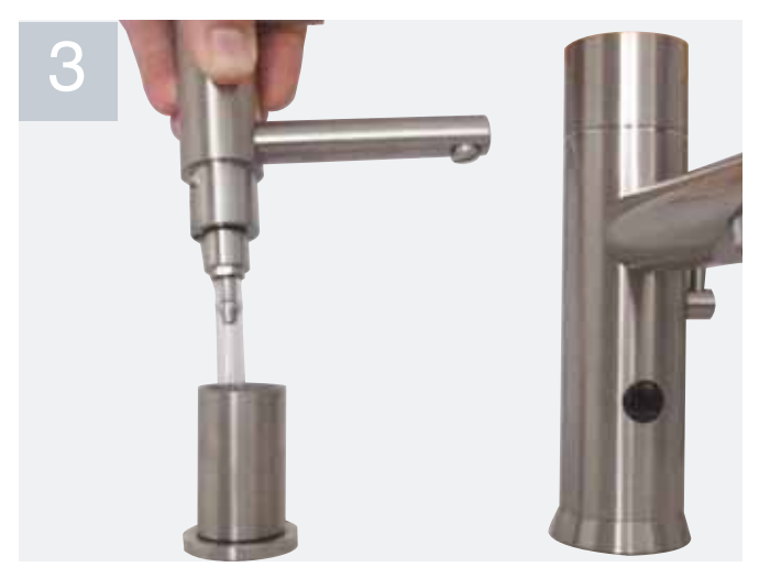
Pull top of dispenser out of base, until the end of the plastic tube appears