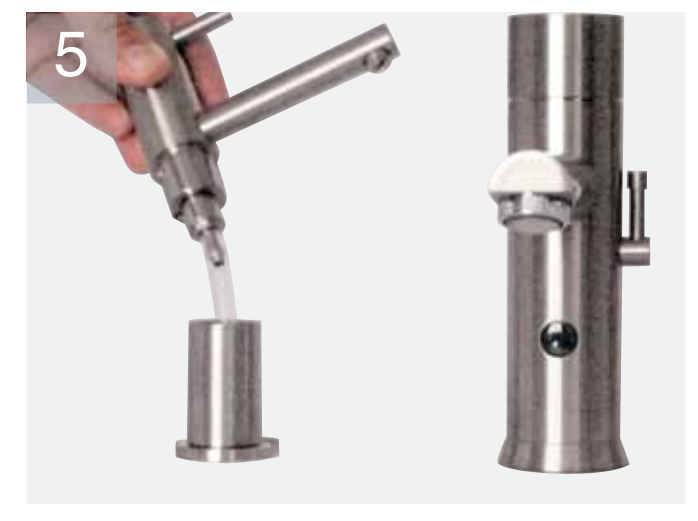
Replace plastic tube and top of dispenser