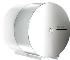
GW03 02 04 02 AISI 304 Bright