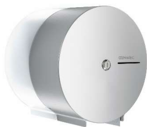
GW03 02 04 01 AISI 304 Brushed