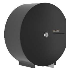
GW03 02 04 03 AISI 304 Matt Black