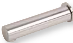
DB 400/425 page 246