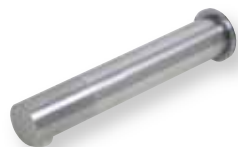
DBL 400/425 page 247