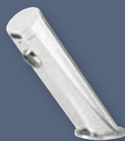
DB 800/825 page 242