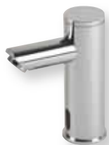
DB 200/225 page 240