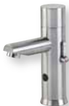
DB 150/175 page 239