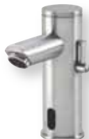
DB 250/275 page 241